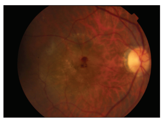
Figure 1. Color fundus photograph shows hemorrhagic PED with subretinal hemorrhage.

The longer wavelength ICG is nearly 100% albumin bound and better penetrates pigment and blood allowing the retinologist to detect hot spots associated with pigment epithelial detachments (PED) and/or hemorrhagic lesions and permitting localization of the CNV membrane (Figure 1). Simultaneous SD-OCT imaging can further enhance localization of an occult CNV membrane and has become an essential tool in differentiating Type 1 (sub PED), Type 2 (sub neurosensory retina) and Type 3 (retinal angiomatous proliferation or RAP lesions) neovascular membranes.<sup>1</sup> Imaging of the sub-PED compartment is now routine practice with SD-OCT technology and identification of lacy neovascular membranes and/or polyps on the undersurface of the retinal pigment epithelial (RPE) monolayer of the PED is important.