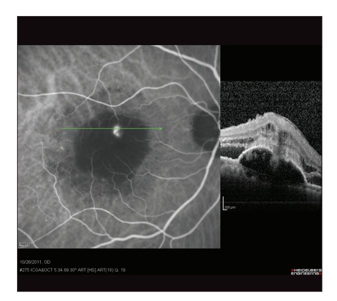
Figure 1. ICG-correlated OCT showing PED with polyp under the RPE. The OCT is correlated to the hyperfluorescent polypoidal lesion on ICG. Note the serous retinal detachment with overlying macular edema and coexisting ERM.

I use the Spectralis SD-OCT with point-to-point localization of OCT scans and high-speed laser video