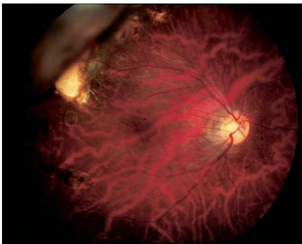
Fig. 2. Fundus photograph showing the postoperative appearance. Note the markedly reduced buckling effect and the superotemporal, white, scleral patch graft. Vision recovered to 20/25.

Postoperatively, the retina remained attached with a best-corrected visual acuity of 20/400 through silicone oil. Three months later, a posterior subcapsular cataract developed. Pars plana lensectomy was performed leaving the anterior capsule intact for future IOL support, combined with pars plana vitrectomy and silicone oil removal. Additional endolaser treatment was added around the edges of the scleral graft to minimize the risk of redetachment. One month postoperatively, the best-corrected visual acuity was 20/40 (+5.75 sphere). Following secondary posterior chamber IOL implantation into the sulcus, visual acuity improved to 20/25 ( -1.25 + 0.50 \times 82 ); the intact anterior capsule remained clear; and the retina remained attached 1 year following buckle removal (Figure 2).